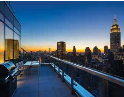
325 Lex | Modern Midtown. 325 Lexington Avenue. 325 Lex sits in the heart of Manhattan amongst New York City's most iconic buildings. Expansive top floor penthouse residence with private roof deck and spectacular city views. Three bedroom, three and a half bath, windowed eat-in kitchen, generous master suite with two walk-in closets and terrace. $8.5M WEB# 3381566 *CD14-0149 Sales Center 212.839.0325 | www.325Lex.com