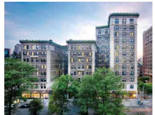
The Astor | The Newest Chapter of A Legacy. 235 West 75th Street. Upper West Side pre-war icon thoughtfully re-envisioned by Pembroke & Ives and conveniently situated between both Central and Riverside Parks. Spacious living, dining, and open kitchen layouts with ceiling heights of 10', custom moldings, and three-paneled doors. One to five bedroom residences priced from $1.525M to over $10M. WEB# 3436624 *CD13-0262 Sales Center 212.501.7575 | www.TheAstor.com