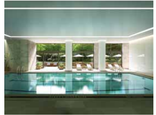
Carnegie Park | Own Your Lifestyle. 200 East 94th Street. Amenities by Robert A.M. Stern Architects. Three-lane swimming pool with adjacent outdoor terrace, half-acre private park, fitness center, children's playroom, outdoor playground, rooftop terrace & lounge. One to five bedrooms from $860,000 to $4,985,000. WEB#3440912 *CD14-0124 Co-exclusive Marketing & Sales Agents: Related Sales & Corcoran Sunshine Marketing Group. Sales Center 212.777.9494 | www.CarnegiePark.com