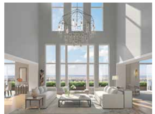
Four Seasons Private Residences, New York, Downtown | 30 Park Place. Legendary service. Unparalleled views. Designed by Robert A.M. Stern Architects, serviced by Four Seasons hotel group & presented by developer Silverstein Properties, Inc. Amenities include a 75' pool, fitness center, private dining room, screening room & children's playroom. One to five bedrooms from $3,425,000 to over $60,000,000. WEB# 3183468 *CD13-0258 Sales Center 212.608.0030 | www.ThirtyParkPlace.com