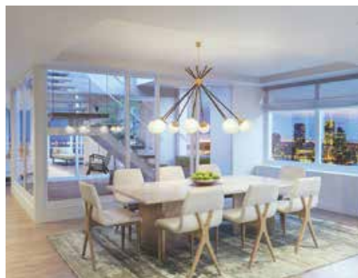
River & Warren | On The Water, Between Two Parks. 212 Warren Street. Penthouse South. 5 bedroom/6.5 bath residence designed by CetraRuddy with dining room, media room & two fireplaces. Includes 2,000+ SF private roof deck with outdoor shower, kitchen, and sweeping water views. Amenities include: resident manager, 24/7 doorman, gym, playroom, and rooftop park with sundeck promenade. $13.888M WEB# 3444579 *CD13-0325 Sales Center 212.888.0076 | www.RiverandWarren.com