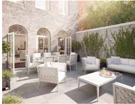
20 East End Avenue | Townhome Three. 4 bedroom/5.5 bath triplex designed by Robert A.M Stern with a gracious living room opening onto a private garden terrace. Formal dining room, private elevator, grand staircase, fireplace, and north/south exposures. Ceiling heights of approximately 11'. Amenities include a private porte-cochère and motor court, wine cellar, curated library, billiards & game room, fitness center, spa, and junior lounge. $11.95M WEB# 3391059 *CD14-0014 Sales Center 212.396.2020 | www.20EastEnd.com