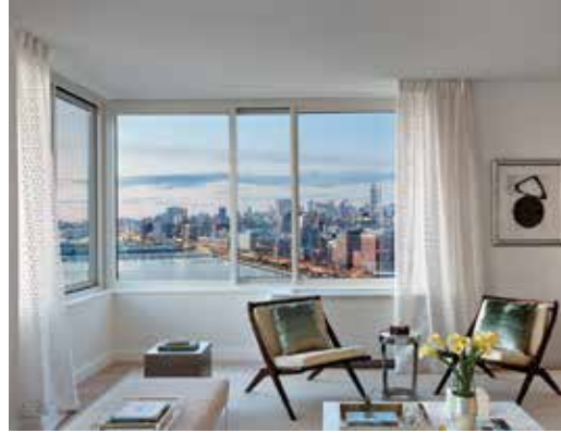
River & Warren | On The Water, Between Two Parks. 212 Warren Street. Residence 26G. 4 bedroom/3.5 bath residence designed by CetraRuddy with corner living room featuring views of the Hudson River and Empire State Building. Multiple exposures include a windowed master bath and kitchen. Amenities include: resident manager, 24/7 doorman, gym, play room, and rooftop park with sundeck promenade. $5.475M WEB# 3416762 *CD13-0325 Sales Center 212.888.0076 | www.RiverandWarren.com