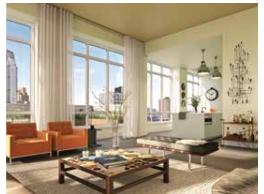
The Boerum | A Unique Expression of Modern Brooklyn. 265 State Street. PH04. This 4 bedroom/3.5 bath residence features more than 2,300 SF of space along with a private 1,689 SF rooftop terrace that offers views of downtown Brooklyn, the harbor, and lower Manhattan. Amenities include library and lounge with outdoor access; fitness center; indoor/outdoor children's playroom; concierge; and parking. $4.15M *CD14-0158 Sales Center 718.488.0265 | www.TheBoerum.com